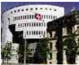
BIS-Botta building in Basel

particularly those dealing with the Basel II implementation – possess a rudimentary understanding of trade finance at best, and they, along with line of business executives, missed the opportunity to shape and influence the treatment of trade finance under this regime.