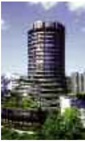
BIS-Tower building in Basel